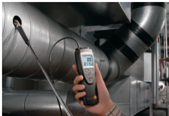
testo 416, e.g. for monitoring the volume flow of the exhaust air